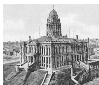
Douglas Co., Nebraska Location: Omaha