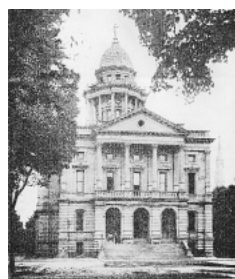
Lorain Co., Ohio Location: Elyria