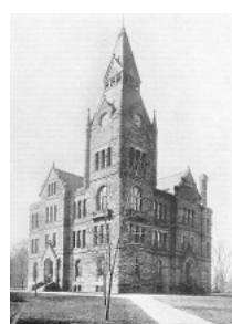
Knox Co., Illinois Location: Galesburg