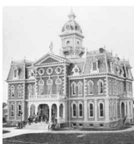
Calhoun Co., Michigan Location: Marshall