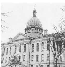
Macoupin Co., Illinois Location: Carlinville