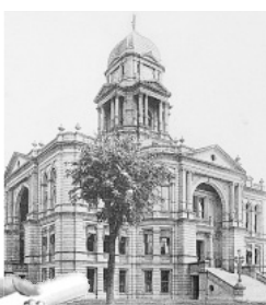
Seneca Co., Ohio Location: Tiffin