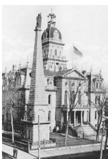
Stephenson Co., Illinois Location: Freeport