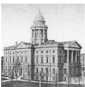
Grant Co., Indiana Location: Marion