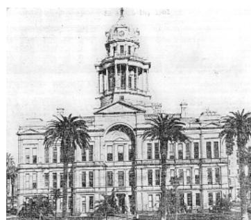
San Joaquin Co., California Location: Stockton