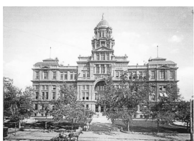
Denver Co., Colorado Location: Denver