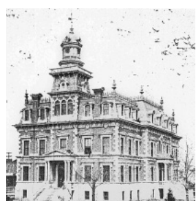
McDonough Co., Illinois Location: Macomb