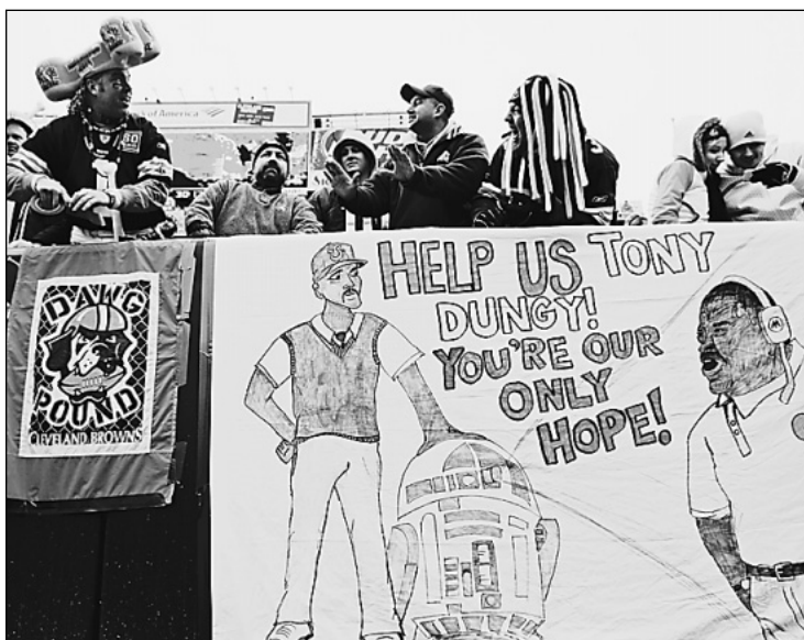
Cleveland fans send out their pleas to the Colts' coach Tony Dungy. The Browns needed Indianapolis to win last night.

he had not played in the NFL in more than a year. Weinke was the fourth quarterback to start for San Francisco this year. The 49ers signed Weinke, 35, on Dec. 12, but this past week was the first time he had practiced with the first-team offense. Weinke completed 13-of-22 passes for 104 yards and a touchdown. He relied heavily on Frank Gore, who rushed 23 times for 94 yards. "I thought he did a good job on such short notice," 49ers coach Mike Nolan said. "He completed some big passes and made some plays. He commanded the huddle well." EXTRA POINTS: New Browns defensive end Bobby Hamilton started in place of Orpheus Roye. Hamilton, a 13-year pro, was signed by the Browns on Wednesday. ... The Browns allowed just 19 sacks this season, the lowest since returning to the NFL in 1999. ... Winslow had 1,106 receiving yards, the third-best single-season total in team history. ... Joshua Cribbs' 135 punt return yards were the second most in a game by a Browns player, just behind Eric Metcalf's 166 yards in 1993 against Pittsburgh.