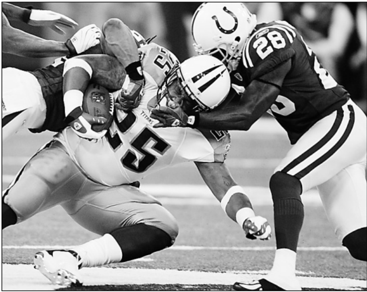
The Titans' LenDale White gets taken down by Marlin Jackson, right, and Bob Sanders. Tennessee plays San Diego on Sunday.

INDIANAPOLIS — Kerry Collins spent most of the season waiting for a chance to prove he could still play. Last night, with a playoff spot at stake, Tennessee's backup quarterback delivered the biggest win of the season. He led the Titans to three second-half field goals, including a 54-yarder from Rob Bironas to retake the lead in a 16-10 victory that left Tennessee celebrating and Cleveland grimacing. The Titans visit San Diego on Sunday. The Titans (10-6) had to win to make the playoffs for the first time since 2003. A loss would have given Cleveland its first playoff berth since 2002. And when Peyton Manning left after two series, things looked good for the Titans. Instead, the offense bogged down after a touchdown drive on the game's opening series. When Vince Young left in the third quarter with a right quadriiceps injury, Tennessee appeared to be in trouble. Collins replaced Young in the middle of a 13-play, 56-yard drive that ended with Bironas' tying 40-yard field goal late in the third quarter. "That's life as a backup. You never know when you'll go in," Collins said. "I hope Vince is all right."