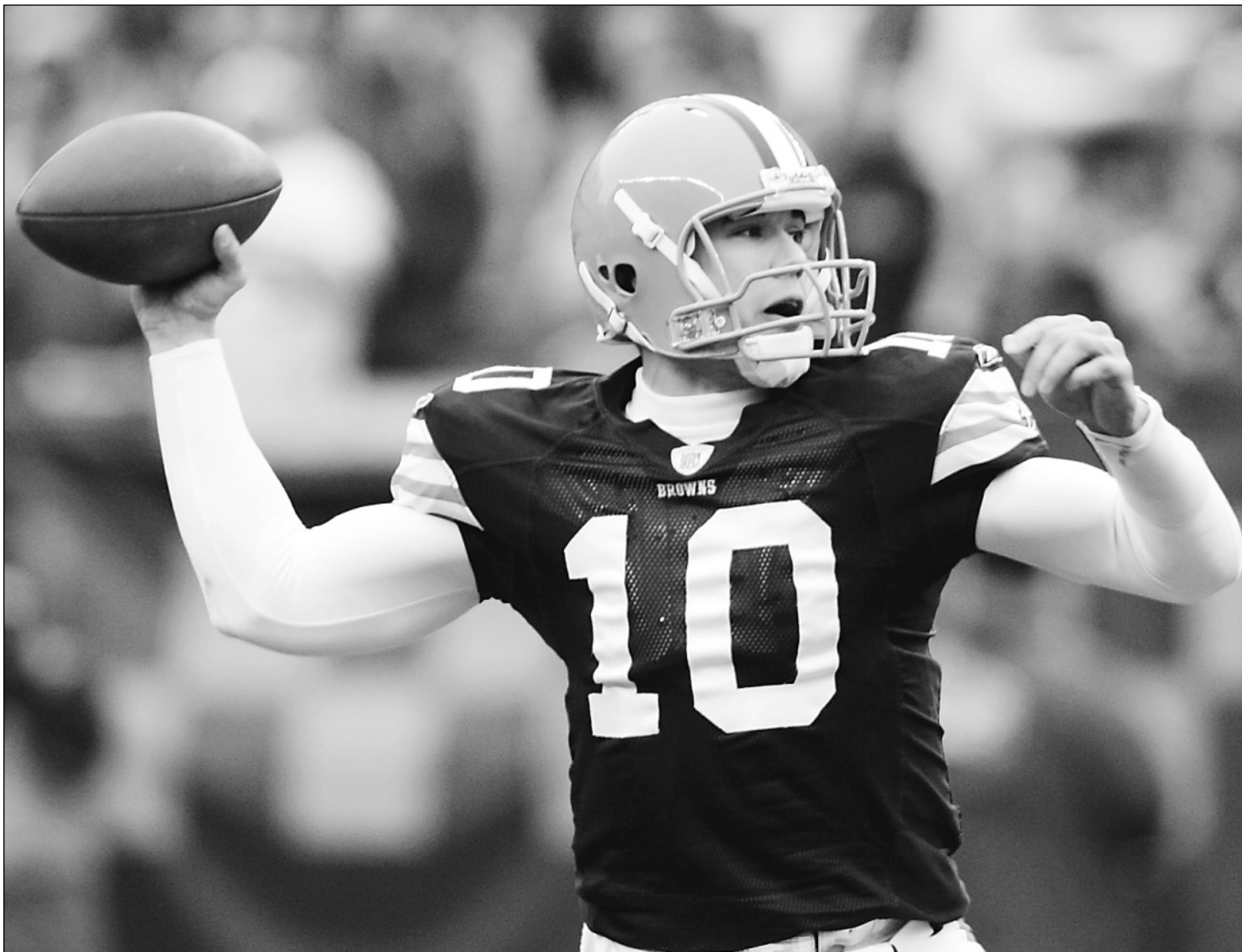
The Browns' Brady Quinn unleashes one of his eight passes yesterday afternoon. He completed three of them for 45 yards.