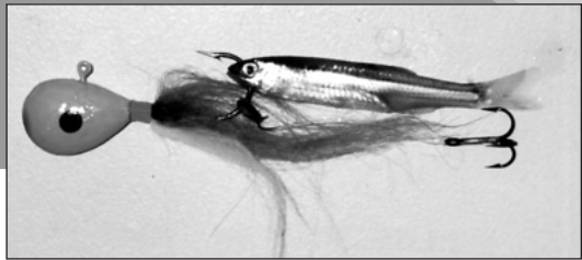
A hair-jig with stinger-hook, dressed with a minnow, left, is the spring standard in Erie walleye waters. Right, a homemade blade bait, also popular in spring fishing.