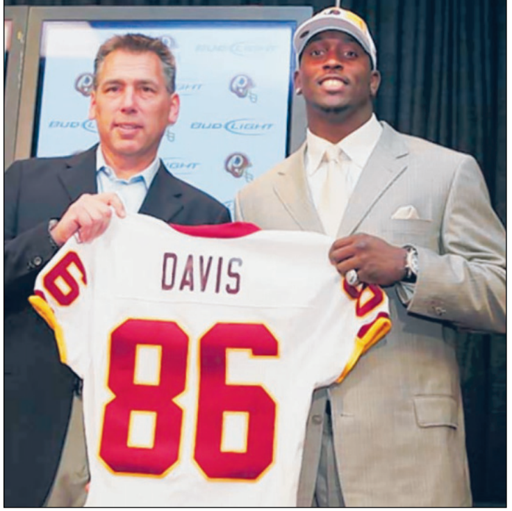
WASHINGTON REDSKINS/BILL WOOD