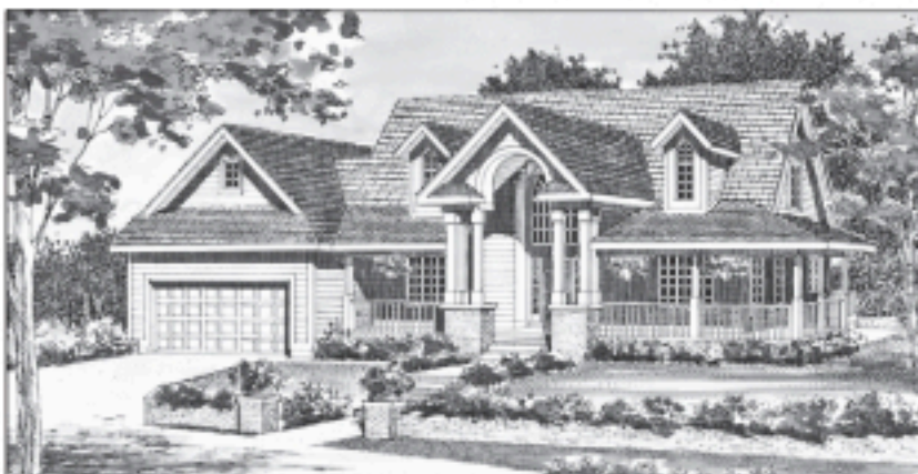
A portico makes a striking architectural statement, with dormers and a wide front porch adding even more curb appeal.

Graceful and even a bit grand, you won't forget this home, Plan HMAFAPW00717 from Homeplans.com.