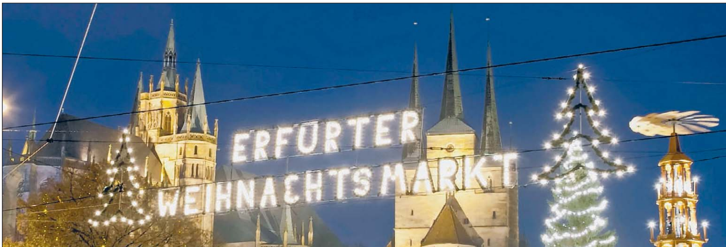
Lights illuminate the Christmas Fair of the Mariendom, left, and St. Severi's Church in Erfurt, central Germany.