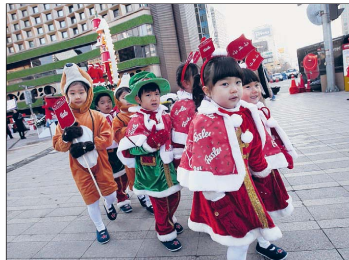
Children in Seoul on Nov. 26.