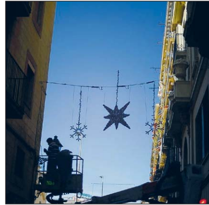
A worker puts up decorations in Barcelona.