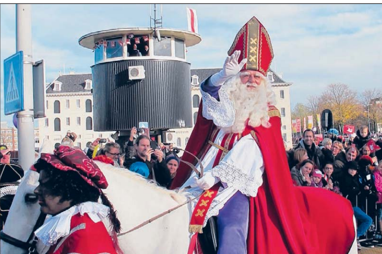
St. Nicholas waves to fans in Amsterdam on Nov. 18.