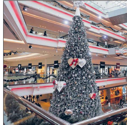
A shopping mall in Hong Kong.