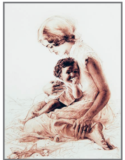
Toledo Museum of Art

▲ Haute cookie cutters — No need to trek to a mall outside Detroit for glitzy items. Neiman Marcus now has selected items for sale at Target , including these cookie cutters in the shape of a shoe, neckties, hat, and sunglasses , along with several stylish cookie dough stamps. $29.99.