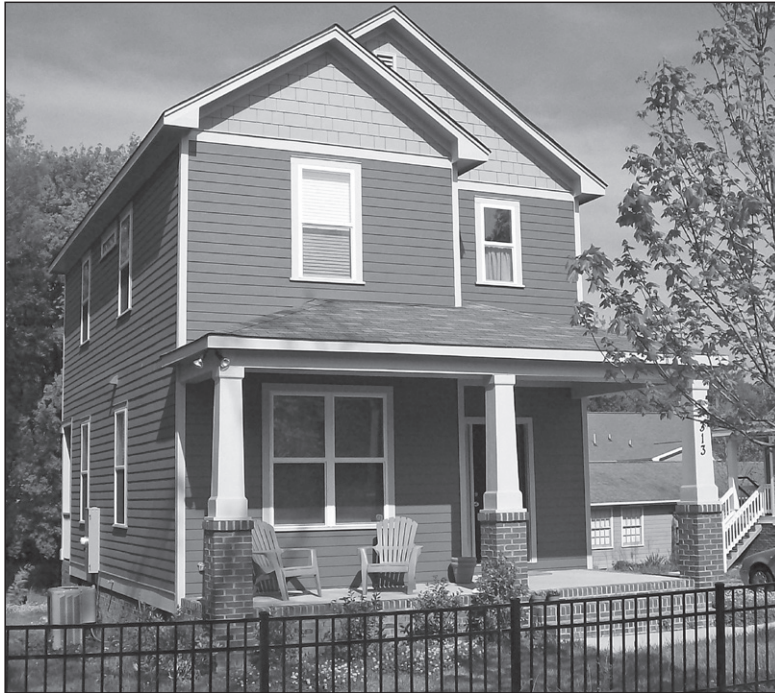
The wide front porch is a great place to relax outside.