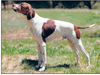
English pointer: a muscled, athletic, high-energy dog.