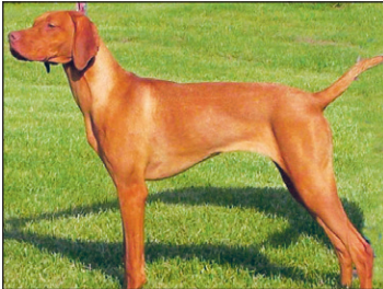
Vizsla: versatile dog that can hunt, track, point, and retrieve.