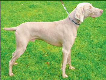
Weimaraner: known for agility in the field and obedience.