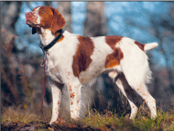
Brittany: the only spaniel that points, and highly intelligent.