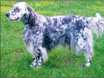
English setter: first trained to sit or 'set' when it found game.