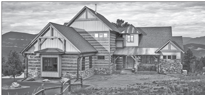
Decorative trusses and rugged stone add lots of interest to the exterior.