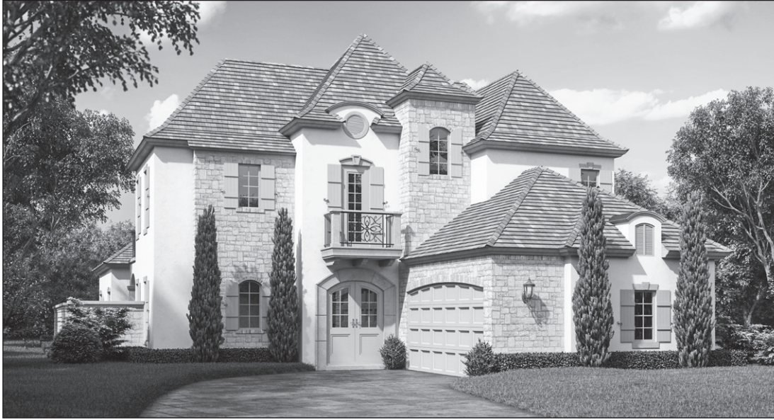
Gorgeous stone and a hipped roof create charming French Country appeal.