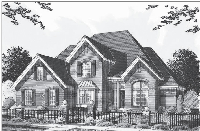
Traditional brick gives a stately appearance to this two-story home. Note the lovely sidelights around the entrance.

To build this home, you can order a complete set of construction documents by calling toll-free (866) 772-1013 or visiting www.ePlans.com/HouseOfTheWeek . You can view previously featured plans, browse other specialty collections, or use our search filters to help you find exactly what you want from over 28,000 home designs. Most plans can be customized to suit your lifestyle. See images of the plan online at www.ePlans.com/HouseOfTheWeek .