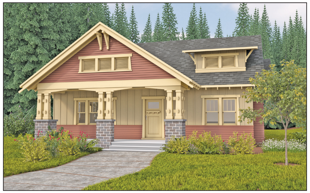
Beautifully detailed porch columns contribute to the Craftsman styling of the exterior.